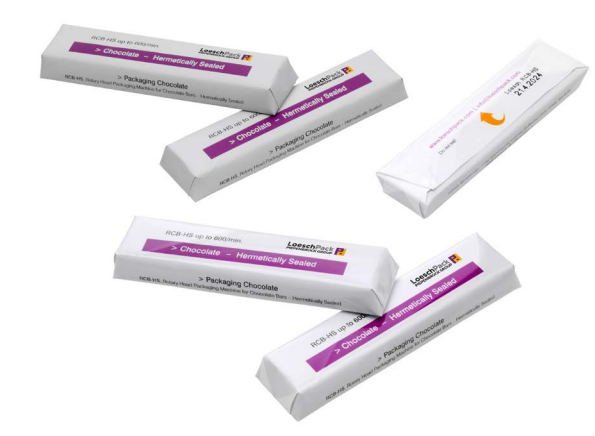
Tight as a flow pack, but with the premium look of a fold wrap

The RCB-HS packaging machine combines the benefits of a traditional die-fold machine and a flow wrapping machine on a single platform. It can produce hermetically sealed packs at a speed of up to 600 products a minute – with the premium look of a fold wrap. The RCB-HS is used wherever exacting demands relating to the look of the packaging accompany high tightness requirements. Thanks to its extremely compact design, the wrapping head machine has a very small footprint at its place of use. The machine is also available in the RCB-H variant for small bars. Both types of machines can create open folds in addition to the tightly sealed packaging variant.