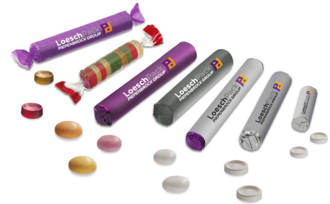
Most attractive price-performance ratio

Format-flexible and extremely compact roll wrapping system for packing round wine gums, compressed and sugar-coated products in the medium performance range of up to 200 packs a minute. This new system, designed for the medium performance range, is based on many decades' experience of manufacturing roll wrapping machines and complies with all standards of modern, economical and efficient confectionery production.