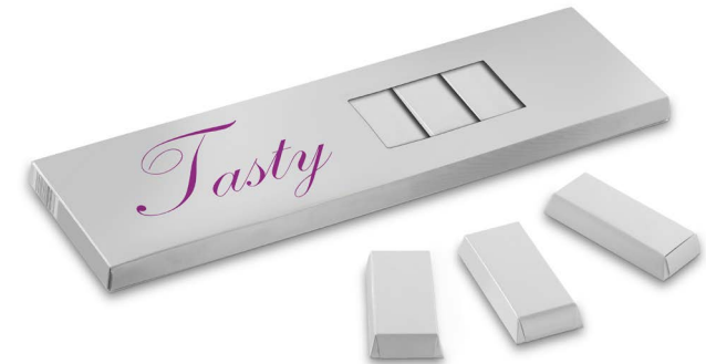
Highlighting of typical product form with trapezoidal boxes